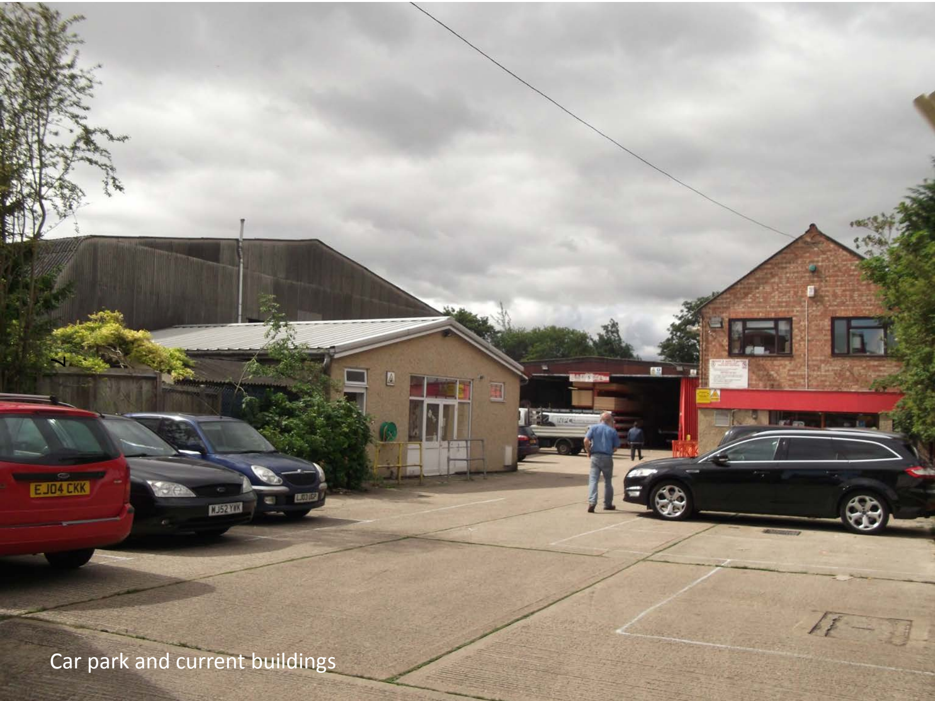
Car park and current buildings