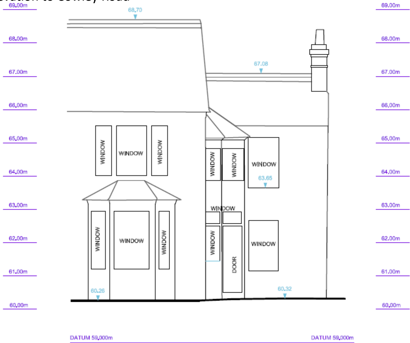
EXISTING ELEVATION A