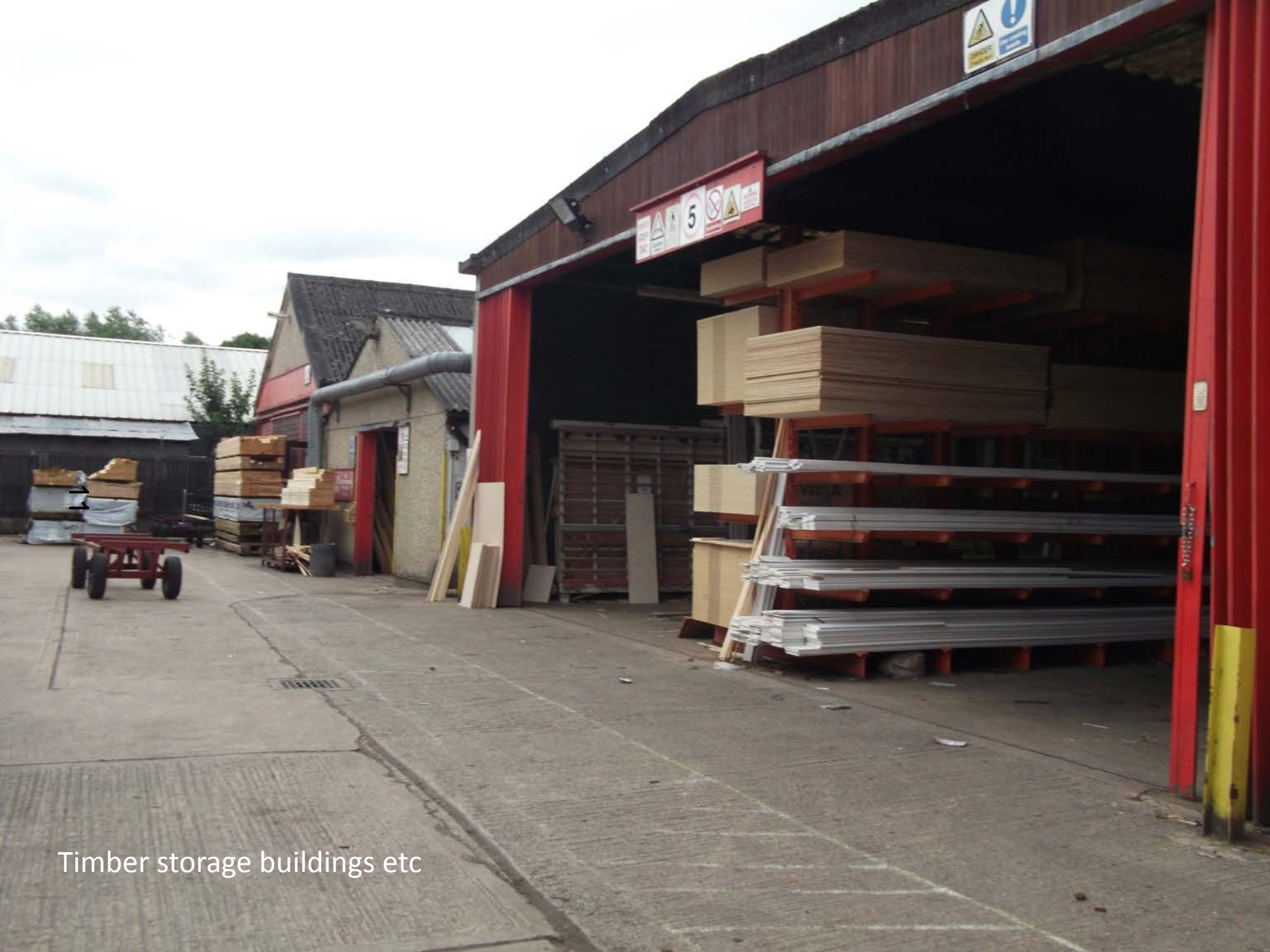
Timber storage buildings etc