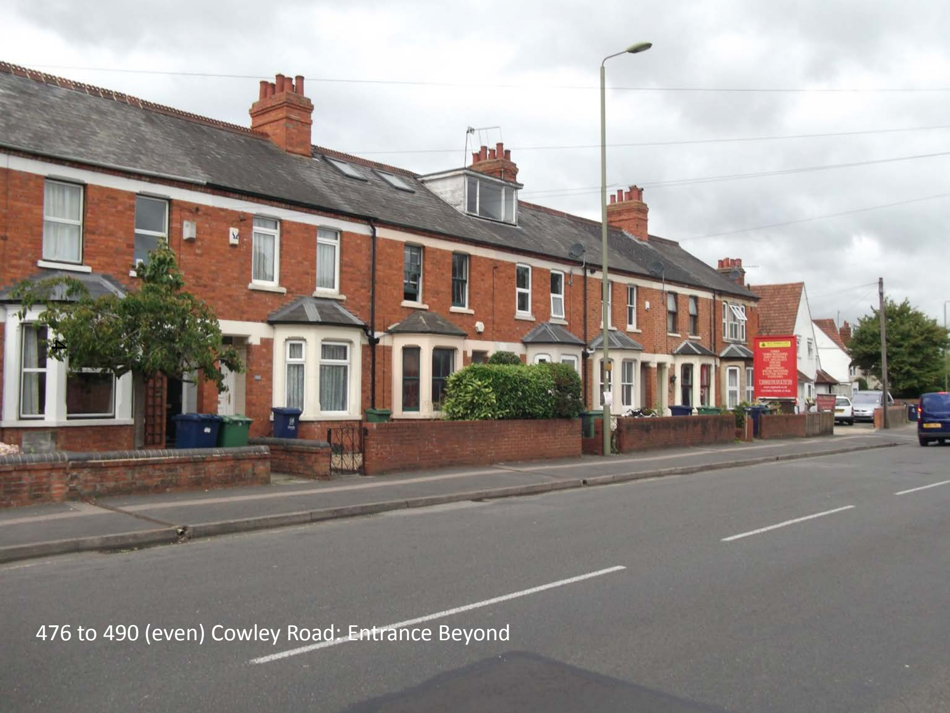
476 to 490 (even) Cowley Road: Entrance Beyond