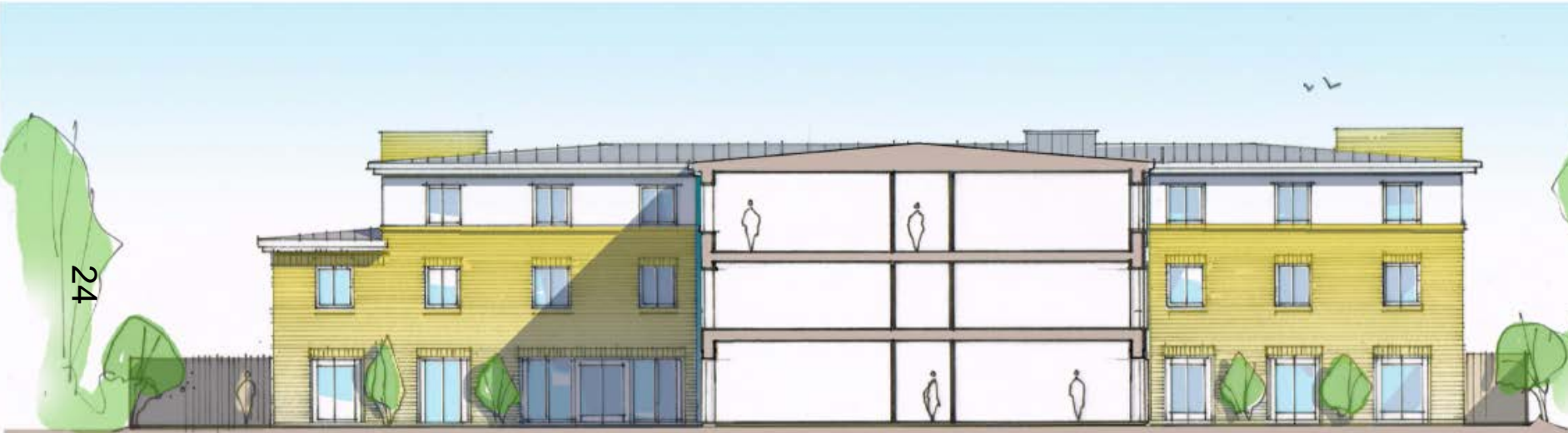
SOUTHWEST elevation - front section of 'T'