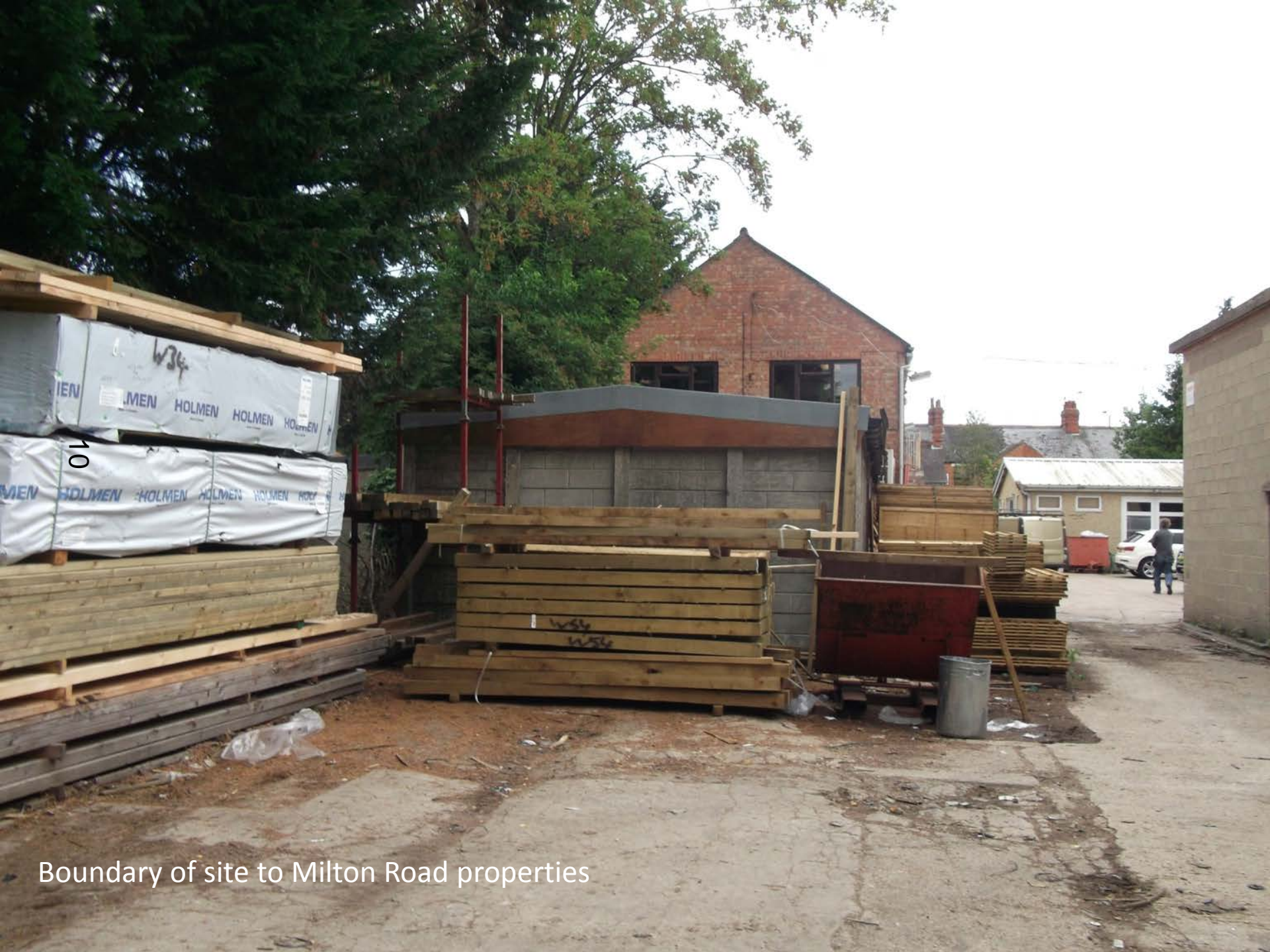
Boundary of site to Milton Road properties